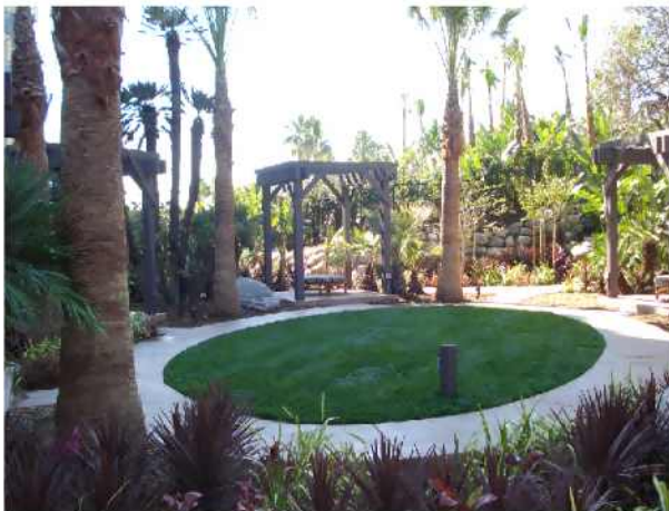
Outdoor Dining Options