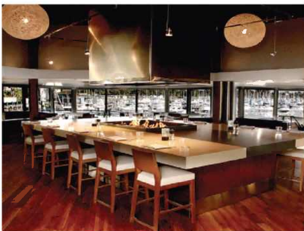
Red Marlin Restaurant