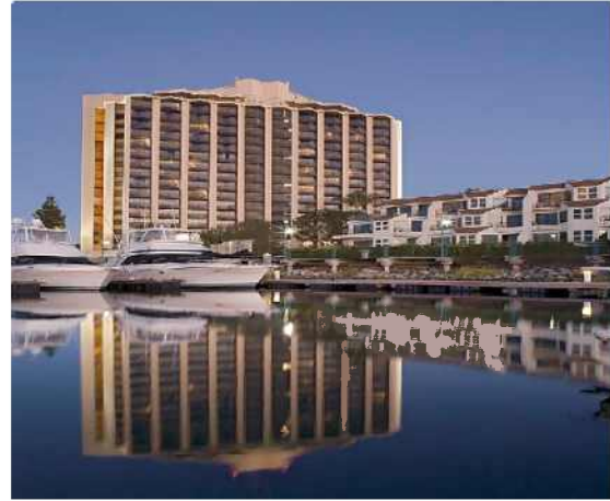
90% Water View Rooms