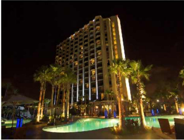
Multiple Pools & Jacuzzi