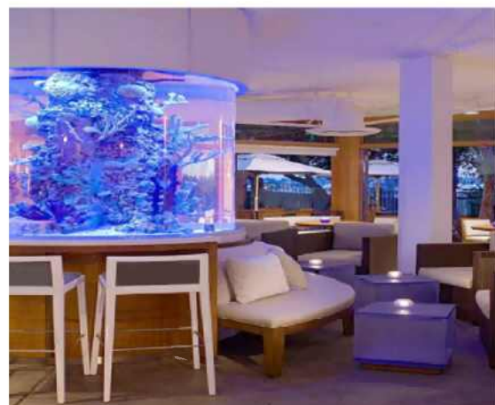
Swim Pool Bar & Lounge